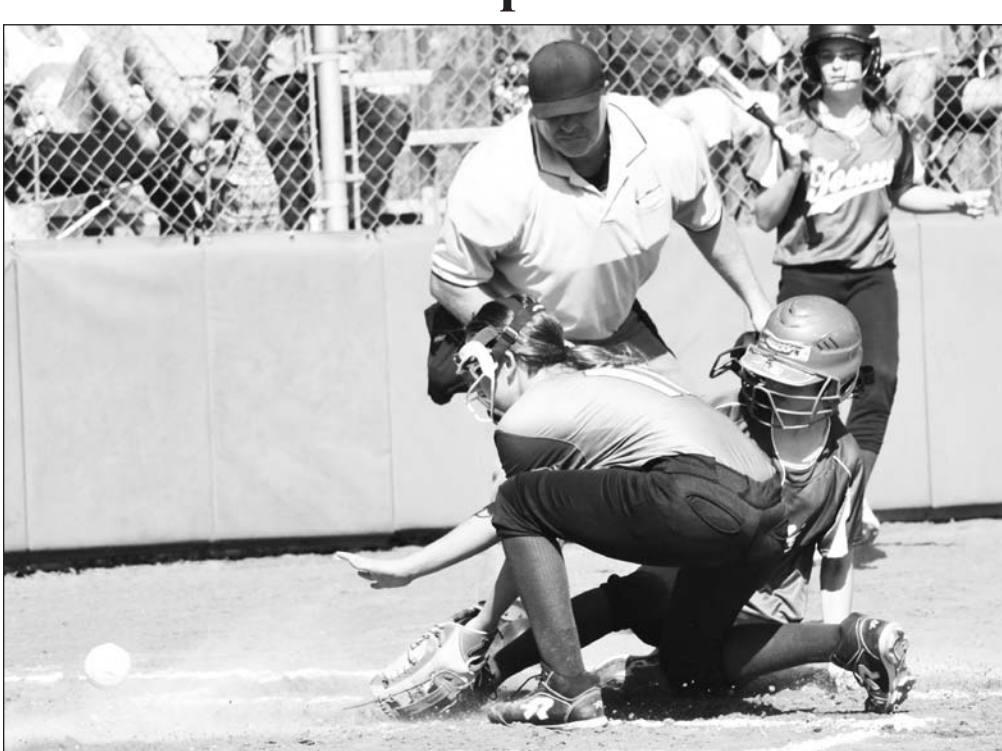
Safe at home! Towns County Middle School's softball team swept a home doubleheader from Hebron Christian last week.